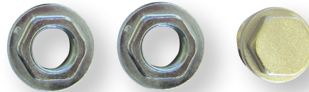
1 – ½ Inch Bushes